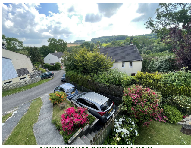
VIEW FROM BEDROOM ONE